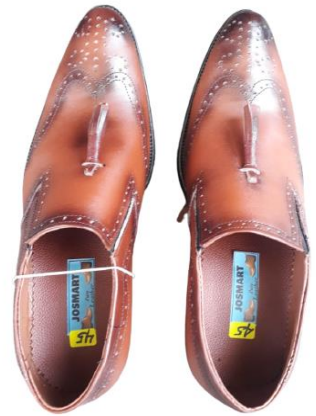
Slip on Brogues