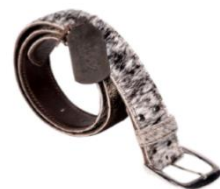
Hair on belt