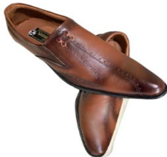
Slip on Brogues