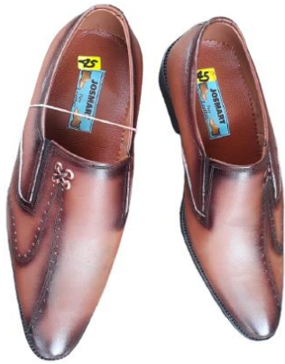
Slip on brogues