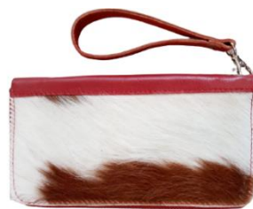
Hair on clutch wallet