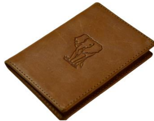
Multi credit holder