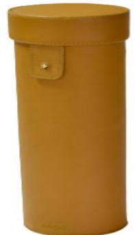
Wine bottle holder